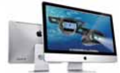
iMac for more permanent placement