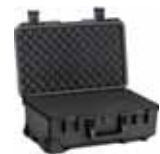
Case for transport and storage