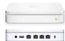
AirPort Extreme Base Station incl. external storage