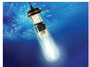
XPV1000W For external box