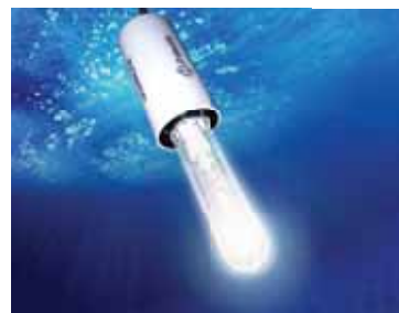
IPV875W "eco" Integrated. Magnetic / Digital