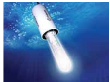
IPV1000W Integrated. Magnetic / Digital