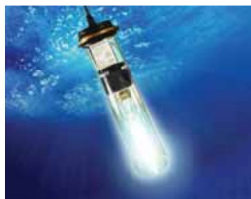
XPV875W "eco" For external box